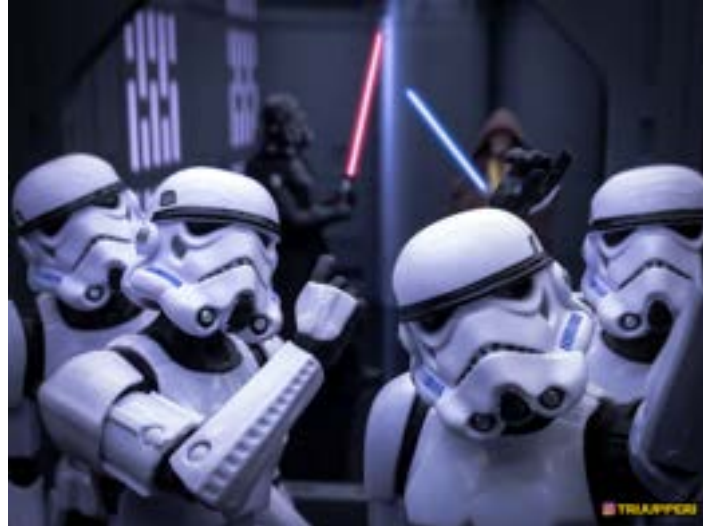
Image 1. “Before the ‘selfie’ there was the ‘Stormie’”, photoplay by Truupperi (Janne Mällinen).