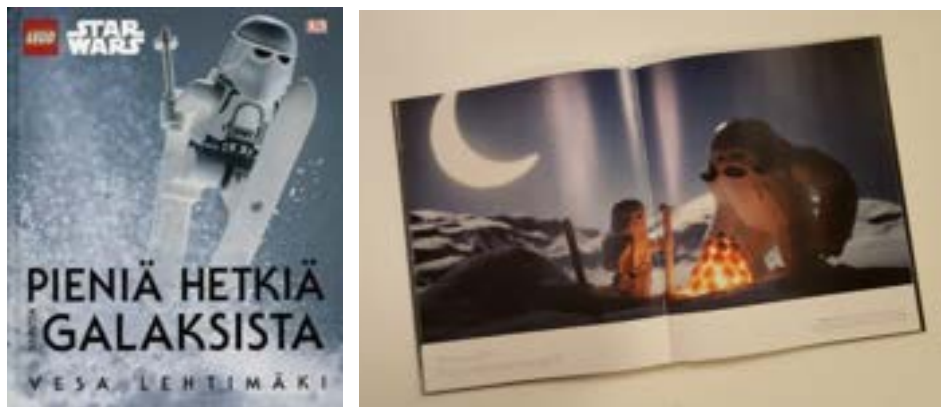
Image 7. Finnish photographer Vesa Lehtimäki’s photoplay book includes richly imagined and staged scenarios featuring familiar Star Wars characters. Image 8. “Erämaan kutsu” [“Call of the Wild”], ‘a tribute to Jack London style storytelling’ in the Finnish edition of the book, p. 89.

Fans produce texts for other fans, not a mass audience (Fiske, 1992). Photoplaying, as an activity similar to textual productivity (Ibid.) or fan labor (Scholz, 2017), can be performed by professionals or amateurs, who influence each other in many ways. According to Scholz (2017, p. 86), “[m]otivated by mutual respect and acknowledgement instead of monetary compensation, fans show off their skills and knowledge, and celebrate their own creativity.” For example, Finnish photographer and Star Wars fan Vesa Lehtimäki, who engages in experimental photoplay with Star Wars toys, published a mass-marketed book with LEGO® named Star Wars®: Small Scenes from a Big Galaxy . Lehtimäki’s professional photoplay is mainly intended to mimic the style of canonical Star Wars films with LEGOs. Fan world-playing with Star Wars toys often follows a similar path.