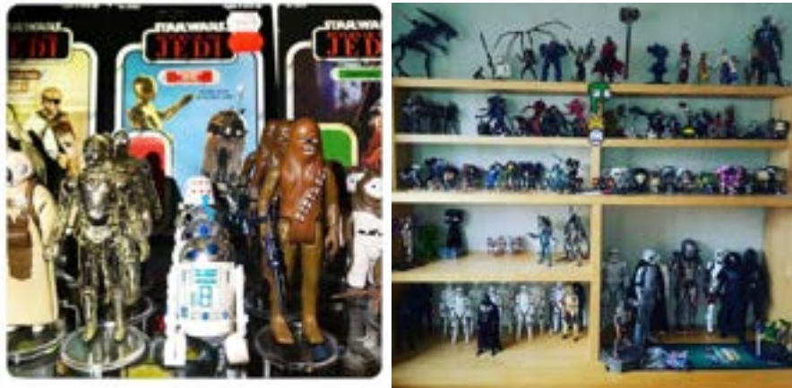
Image 5. Kenner's Star Wars figures displayed and photographed by TOY VILLAIN, a vintage toy collector from Malmö, Sweden. Image 6. Display of a collection of various characters, including those from Star Wars , photographed by www.headhunterstore.com .

making it possible to simultaneously care for the collection and share documentation of it. Object interactions result from searching for, observing, admiring, and acquiring toys. Despite the increase in digitalization, the collection, arrangement, and display of physical objects has remained a popular pastime. Manipulation, in which toys are explored and then dis-played , is also common. Once-hidden toy treasures are proudly assembled and showcased to the world through unboxing videos, collection run-throughs, play tutorials, and published “photoplay” (Heljakka, 2017). Display of the toys is the initial step of world-playing discussed in this essay.