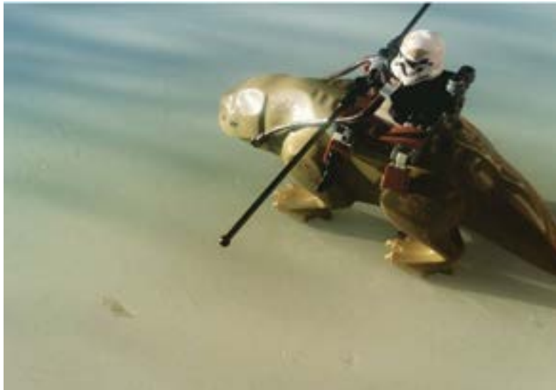
Image 4. “Now in stock, Lego Sandtrooper and Dewback.”

Using this interview contextualization process for both research materials and methodology, my goal is to answer the research question: how do adult toy players who are fans of the Star Wars universe actively engage in world-building through world-play ? By presenting the results of the multi-methodological study presented here, I aim to demonstrate new evidence regarding adult world-play in connection with Star Wars -related toys.