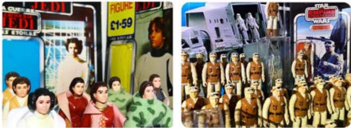
Image 2. Variations of a Leia action figure. Image 3. Variations of a vintage Rebel soldier photographed by TOY VILLAIN, a vintage toy collector from Malmö, Sweden.