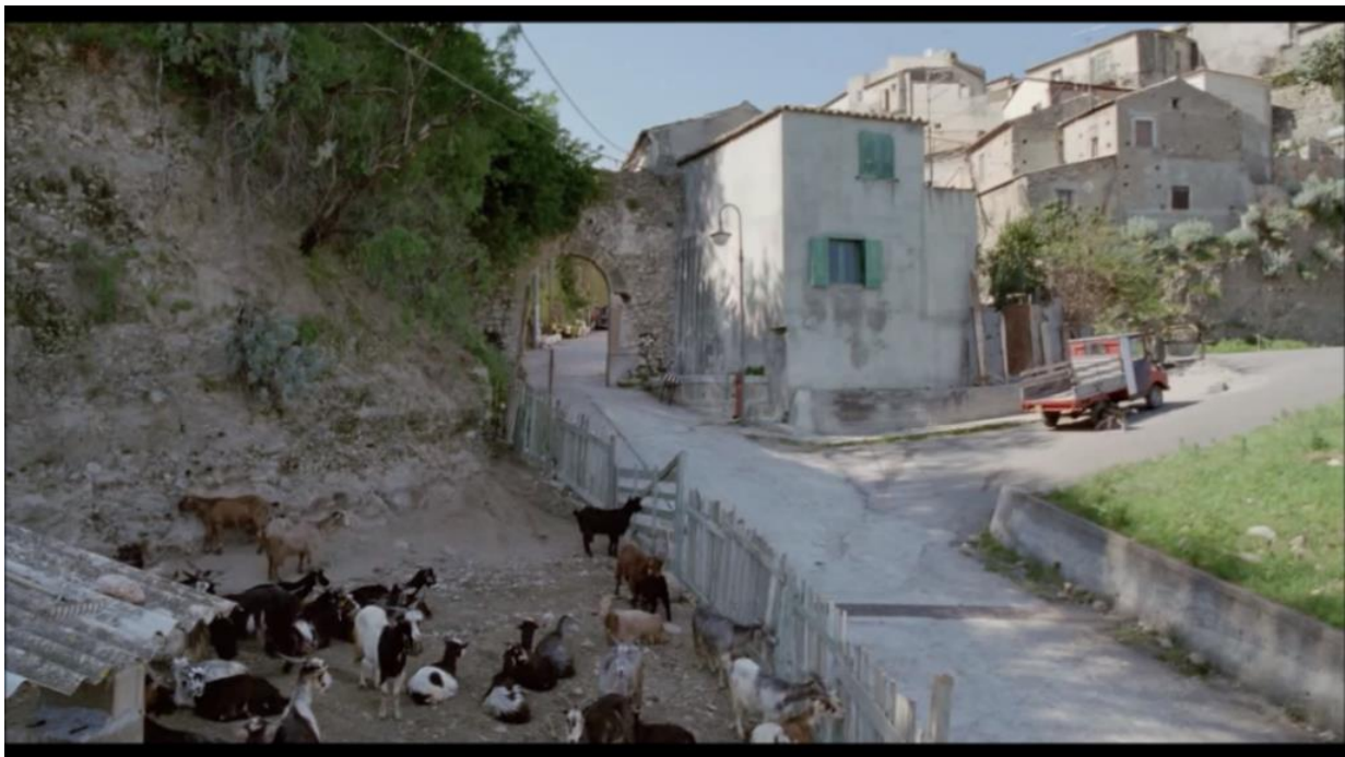
Figure 2: A still from Le quattro volte : the road outside the town gate.

The film repeatedly foregrounds the impossibility of containing the natural. We see the goatherd—effectively, the film’s only human character—collecting snails and placing them in a large pot: the goal, we infer, is to purge them until they are edible. A brick weighs down the lid to keep the snails from escaping. But when the man returns home, he finds the snails all over the kitchen table; he patiently collects them and puts them back in the pot. In a later scene, a long static shot displays the road winding off one of the town gates, with the goatherd’s house in front and the enclosure where the goats are kept on the left-hand side. A pickup truck is parked on an incline on the right (see Figure 2). In this scene, a particularly fractious herding dog unexpectedly removes the wheel chock that keeps the truck in place, so that the vehicle rolls backward, smashing into the fence and thus freeing the goats. The animals then flood the road and enter the goatherd’s apartment. One of them, standing on the kitchen table (see Figure 3), intentionally topples the pot with the captive snails.