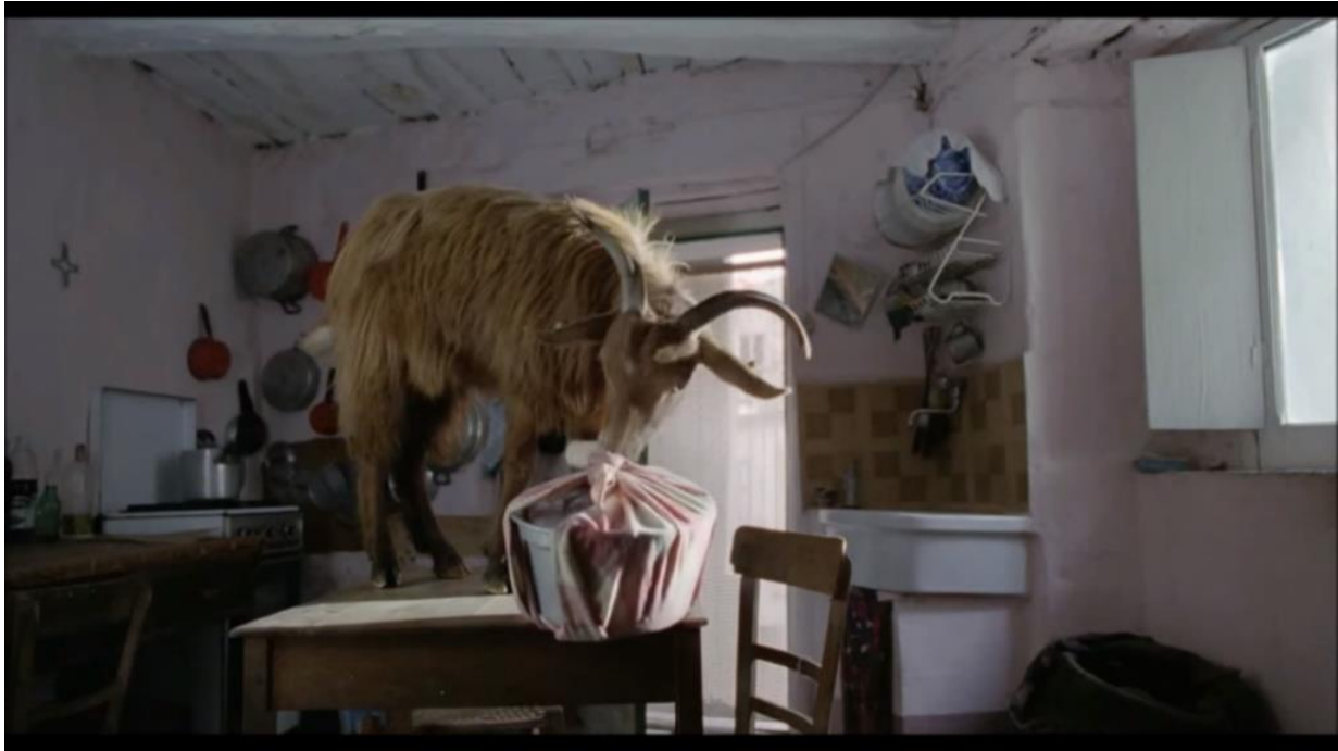
Figure 3 : Goat on table, from Le quattro volte .